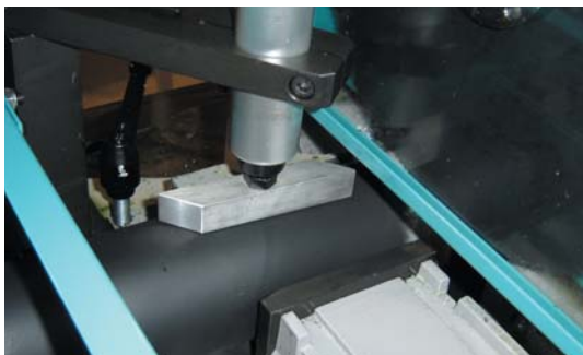
Top Clamp Semi-automatic models only