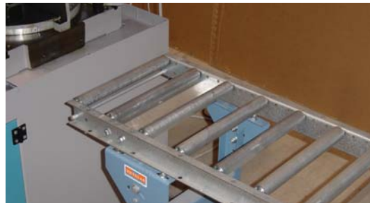
Freestanding Roller Conveyors 5' and 10' lengths available