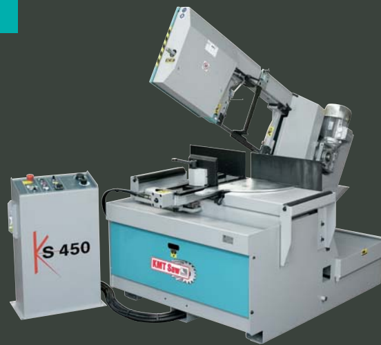
Model KS450 14" Capacity

Fully hydraulic, with free-standing operators console that may be conveniently placed in the most advantageous operator location.