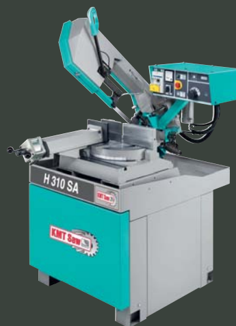
Model H310SA 10" Capacity