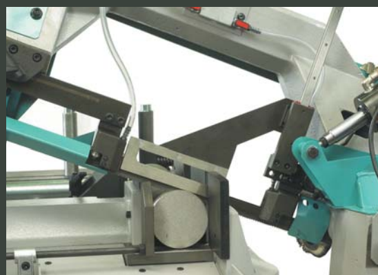
Automatic material sensor minimizes machine setup on semi-automatic models