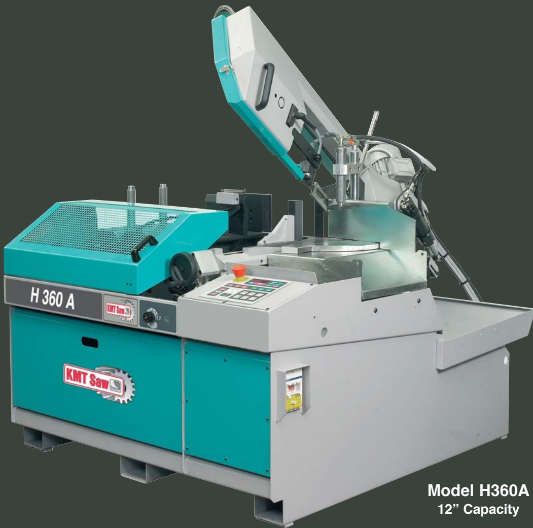
Model H360A 12" Capacity

Sawing Controls Simple, logical, and easy to understand