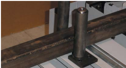
Vertical Side Guide Rollers For Custom conveyors only