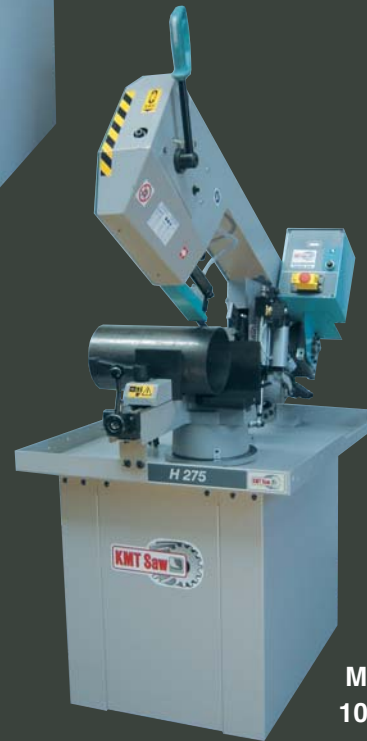
Model H275 10" Capacity