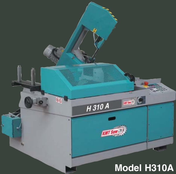
Model H310A 10" Capacity View of infeed