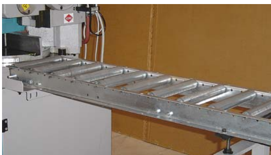
Custom Roller Conveyor w/micro-adjustable legs, mounted to machine, 5' and 10' lengths available.