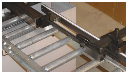
Accu-cut custom length system Stop with scale, micro-adjustable legs.