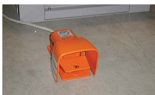
Footswitch Semi-automatic models only

Kalamazoo Machine Tool Co. Inc. 6700 Quality Way Portage, MI 49002 (269) 321-8860 • Fax (269) 321-8890 www.kmtsaw.com