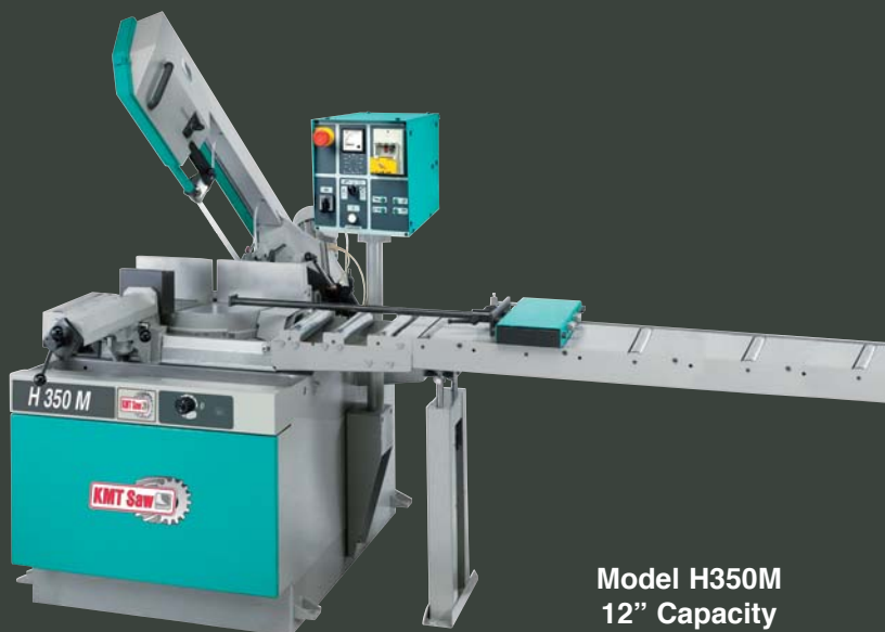
Model H350M 12" Capacity Shown with optional measuring system

AutoCut Series Mitering Bandsaws miter up to 45 degrees left and 60 degrees to the right.