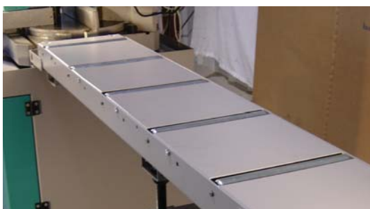
Custom worktable/conveyor w/micro-adjustable legs, mounted to machine. Cover plates between rollers provide worktable surface 72" and 144" lengths available