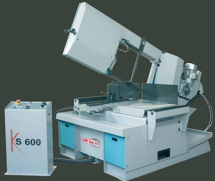
Model KS600 20" Capacity