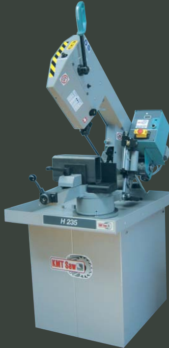
Model H235 8" Capacity

Conveniently located hydraulic feed control, blade speed knob, indicator lights and emergency stop button.