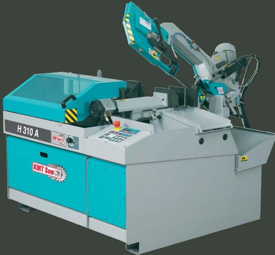
Model H310A 10" Capacity

Models H310A and H350A are fully hydraulic, with a shuttle barfeed and heavy duty carbide guides. Mitering capability is manual, up to 60 degrees to the right. Setup is quick and easy, with all functions convenient to the operator. Construction is one piece unified construction so the machine maintains alignment and accuracy throughout its' entire lift.