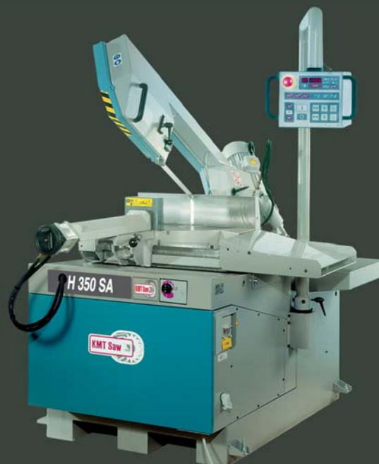
Model H350SA 12" Capacity