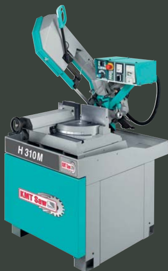
Model H310M 10" Capacity

For structurals and solids, up to the maximum machine capacity