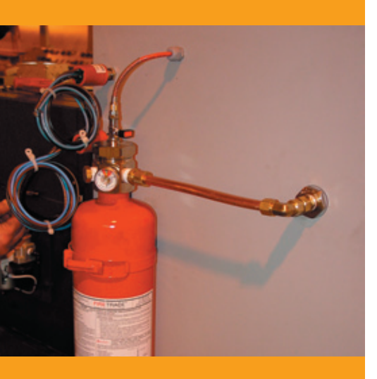
Mounted Firetrace system including pressure switches