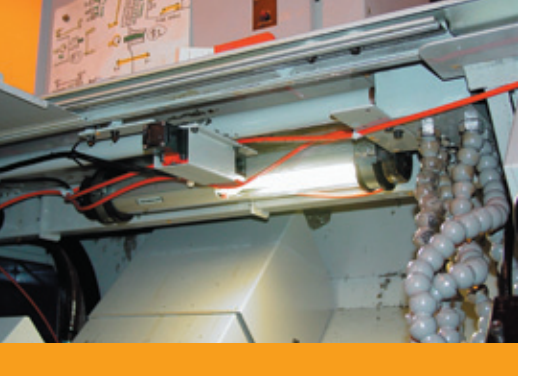
Red Firetrace Detection Tubing runs unobtrusively through the working area