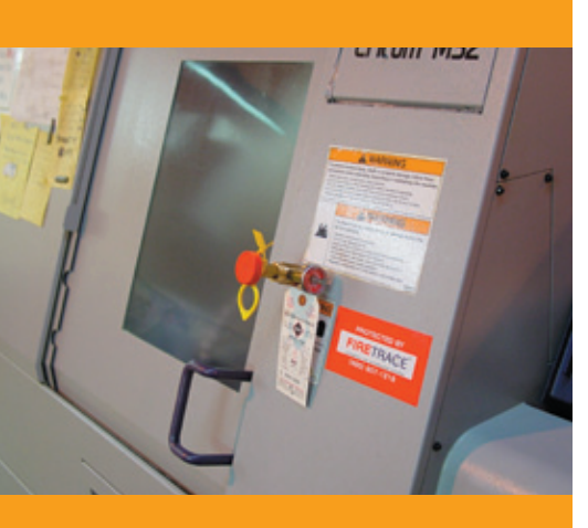
Optional manual release